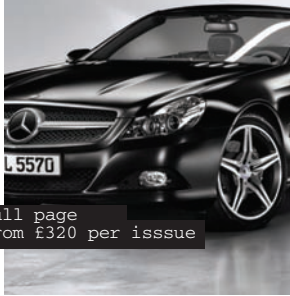
Full page from £320 per issue