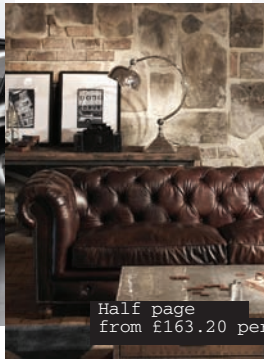
Half page from £163.20 per issue