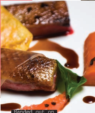
Handed out on Abbeygate Street each month