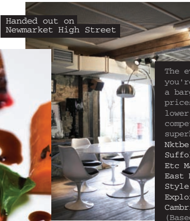
Handed out on Newmarket High Street

The evidence is blinding, you're clearly destined for a bargain with us as our prices are considerably lower than those of our competitors, yet we offer superb quality.